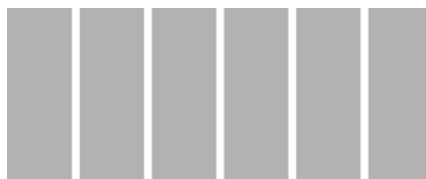
2505 x 1010 mm

All Murdotec® plastics are available in this sizes. Further formats on request. Thickness tolerance: +0/ +0,4 mm