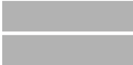
4080 x 1005 mm