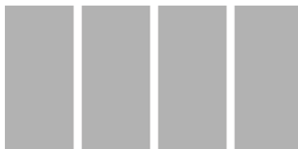
2005 x 1020 mm