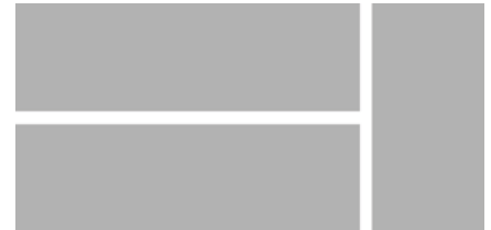
3060 x 1005 mm/ 2005 x 1020 mm