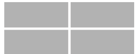
3060 x 1250 mm