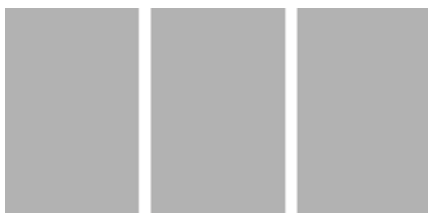
2005 x 1335 mm